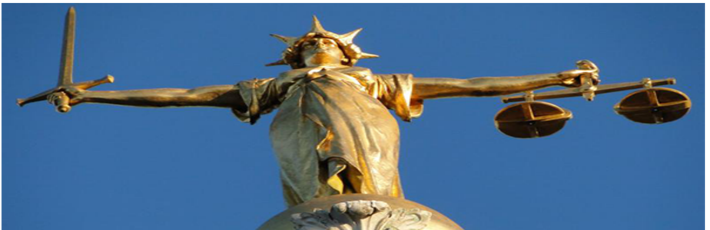
Lady Justice, Old Bailey.

A foundational principle of liberal democracy is that all citizens are equal, and so the protection of fundamental human rights is of critical importance for democratic effectiveness. In many countries a statement of citizens' rights forms part of the constitution, and is especially enshrined in law and enforced by the courts. This has not happened in the UK, which has no codified constitution. Instead, in an article from The UK's Changing Democracy: the 2018 Democratic Audit , Colm O'Cinneide evaluates the more diffuse and eclectic ways in which the UK's political system protects fundamental human rights through the Human Rights Act and other legislation, and the courts and Parliament.